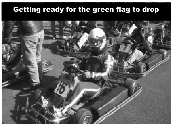
Getting ready for the green flag to drop

It was explained that the first session served as both practice