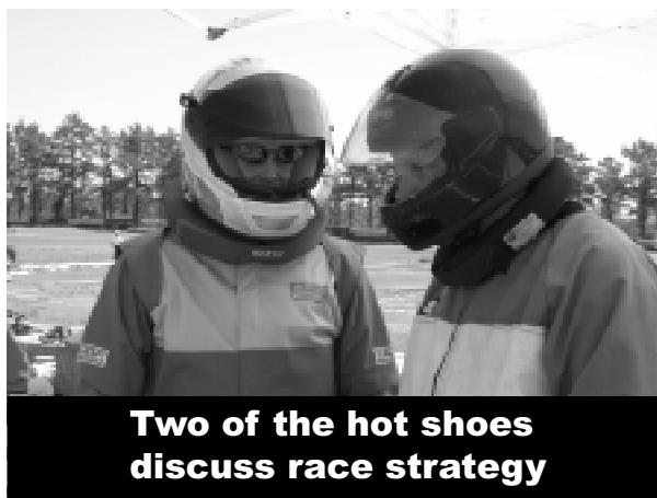
Two of the hot shoes discuss race strategy

The four hour race requires a minimum of eleven driver changes which means that average stint was twenty minutes. It was a beautiful sunny day, hot but no humidity – a perfect day to be outside. The race started with a rolling two by two start. Jeff took off at the green flag and led the first few laps. One of our ringer hot shoes started our kart to get us off to a good start and demonstrate how to deal with