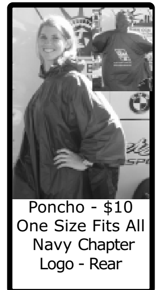
Poncho - $10 One Size Fits All Navy Chapter Logo - Rear