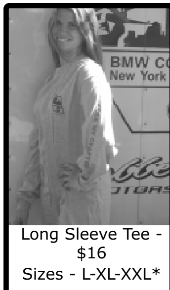
Long Sleeve Tee - $16 Sizes - L-XL-XXL*