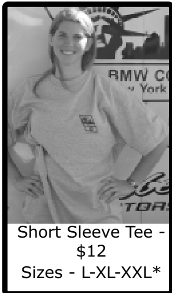
Short Sleeve Tee - $12 Sizes - L-XL-XXL*