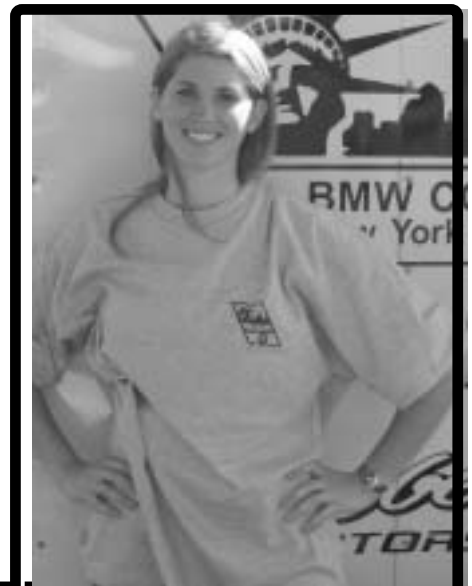
Short Sleeve Tee - $12 Sizes - L-XL-XXL* Steel Grey Chapter Logo - Front