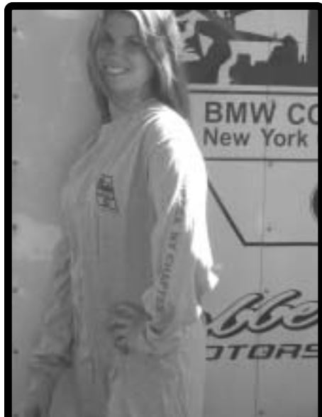
Long Sleeve Tee - $16 Sizes - L-XL-XXL* Steel Grey Chapter Logo - Front