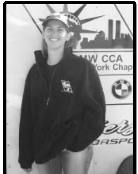
Fleece Jackets - $49 Sizes - S-M-L-XL-XXL* Navy•Black•Red•Grey Chapter Logo - Front