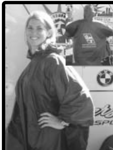
Poncho - $10 One Size Fits All Any color as long as it is Navy Chapter Logo - Rear