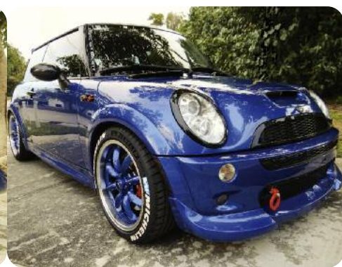
Blacked out headlights, grille, belt-line, Cravenspeed tow hooks and carbon fiber badge covers give a much more aggressive front look.