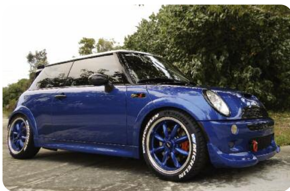
The 2006 MINI Cooper S's stance is drastically changed with custom paintwork, wheels, tires, wing and other enhancements.

Starting with the visuals, it was decided early on that the unpainted black plastic wheel arches and parts of the front and rear bumpers would make the car look far sleeker if painted. Along with this, a set of custom wheels with a slightly larger width were chosen. Keeping with the look of the original MINI Cooper that had optional Panasport wheels, a set of ROTA RB Wheels were selected measuring 17"x7.5" ( www.rotawheels.com ). To make them truly unique, the faces and barrels were painted Hyper Blue Metallic to match the factory paint. This impeccable work was performed by one of the country's premier automotive body shops; Autokrafter's of Riviera Beach, Florida ( www.autokrafterspb.com ) They repair, restore, and