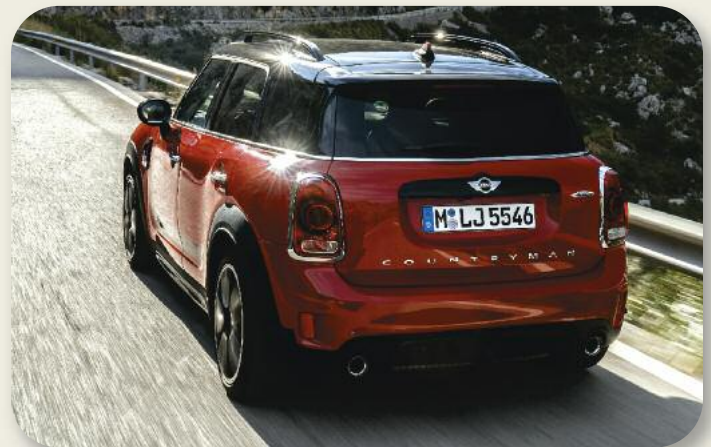
Americans current love affair with SUVs, CUVs and crossovers helped raise sales of the Countryman 29.1% while overall sales of MINIs in October were down 14% from the previous year.

I hope everyone has a wonderful holiday season this year and has a prosperous New Year. Safe motoring and remember to wash the salt from the undercarriage to prevent rust. Take care.