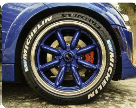
Beautiful ROTA RB wheels are reminiscent of the original MINI-lites or Panasport wheels.