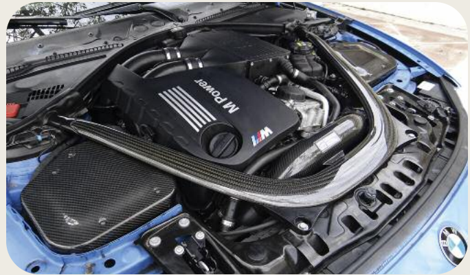
▲ The CSF Intercooler upgrade with the AWE Tuning S-Flo Carbon Fiber intake & AWE Tuning heat exchanger (not shown)

In essence, there's an endless array of things to be done to these, and pretty much any car on the road today. It just so happens that the aftermarket is particularly strong with BMW's ///M cars as the demand for upgrades is huge. We live in a golden age for modifying cars, where parts are easily accessible and the choices so vast. If you've ever considered owning one of the S55-powered M3 or M4 cars I highly recommend them. With just the right upgrades, you too can have a BMW that, when properly equipped, can outrun many of today's exotics and supercars alike for a fraction of the cost.