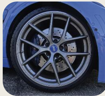
▲ Beautiful Yaz Marina Blue F80 M3 on 20" BBS CI-R wheels with Michelin Pilot Sport 4S tires