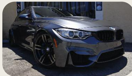
◀ F80 M3 in Mineral Gray Metallic with H&R Sport Lowering Springs and hub-centric wheel spacers

Next up, was another F80 M3 finished in Mineral Gray Metallic shown here. This particular vehicle was equipped with Meisterschaft 90mm performance downpipes protected with titanium heat wrap, H&R Sport Lowering Springs, H&R hub-centric wheel spacers, and a custom ECU Tune from Velocity Factor. The owner noticed the car had some serious hard-water staining in the paint and asked for help, which came by way of a full vehicle paint correction with two stages of the finest ceramic coating to bring back its visual luster and shinewith the utmost in protection. To say the car ended up looking and performing far better than it ever did would be a huge understatement. Lastly, a Meisterschaft GTC Valve Controlled exhaust system with wireless, one-touch remote controls was installed and made this M3 sound as good as it performed!