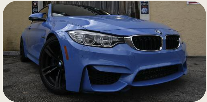
▲ Yaz Marina Blue BMW M4 sitting nicely with H&R hub-centric wheel spacers front and rear