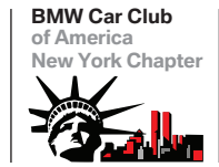
Provisional new logo