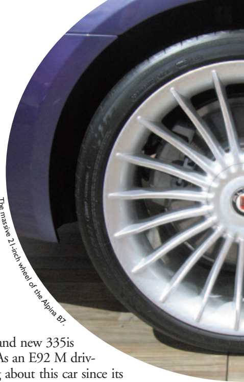
The massive 21-inch wheels of the Alpina B7.