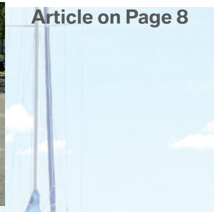
Enjoying a beautiful spring day at The Red Rooster.