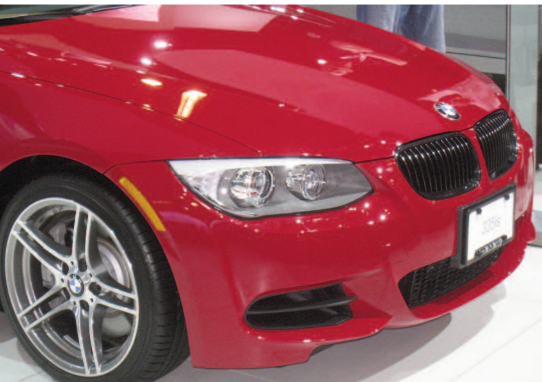
Front fascia of the 335is, note the M3 like air intakes on the bottom.

The presentation team also presented the facelifted X5, the very special Alpina B7 and the brand new F10 5 series. I did not pay much attention to the presentation of the X5 and the Alpina since I never considered owning them. SAV was never my cup of tea. The Alpina B7 is a great car but way above my budget with a MSRP of $122,875. The F10 5 series, on the other hand, fits my budget just right. It looks less flamboyant than the previous