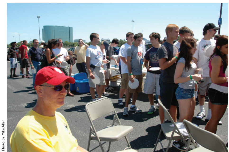
Lining Up for Lunch Gives Teens a Chance to Start Texting Again