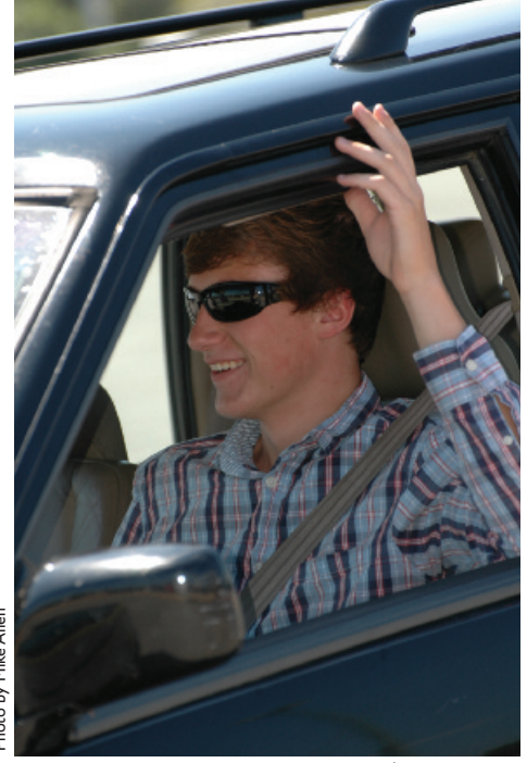
Look: A Teen Enjoys Himself While Learning. And He's Not Even Texting..