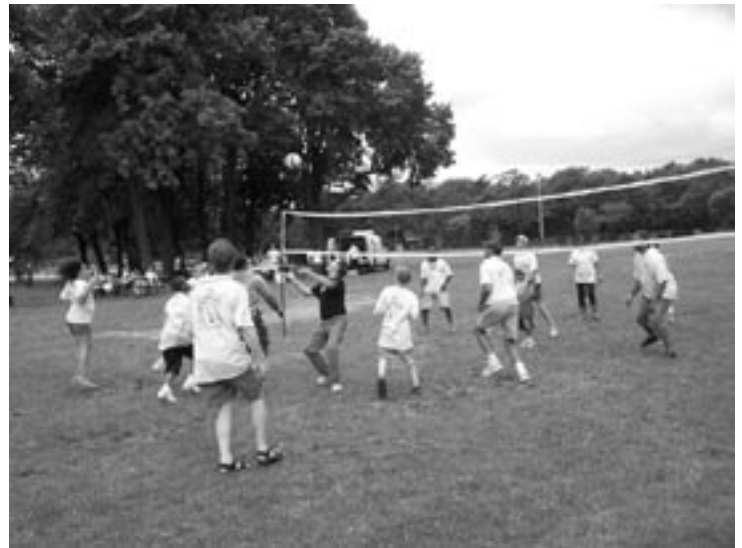
Playing Volleyball: The Calm Before the Storm

After everyone filled their bellies, we decided to work it off with a few games of volleyball. There was a mix of adults and children on each team and everyone had a great time. We were about 40 minutes into the game when Mother Nature decided we were having too much fun. All of a sudden the skies turned black and a gust of wind blew down the volleyball net, tents and sent everyone scrambling. Although the time was short, we had tons of fun. It was disappointing that we were not able to raffle the door prizes that were supplied by the