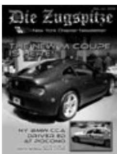
On The Cover The new BMW Z4 M Coupe as seen at the New York Javit's Auto Show.