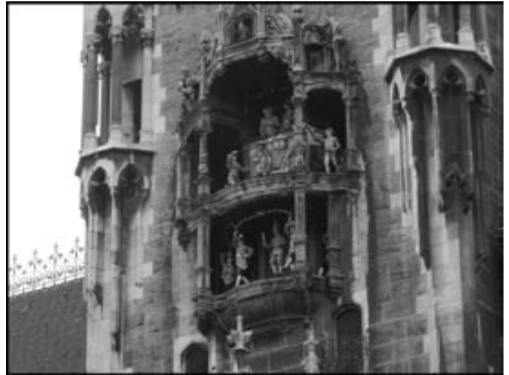
The Authentic German Glockenspeil

The trip went by much too quickly. It was time to head home. On the way to the airport, at about four in the morning German time, our taxi driver was doing about 120 mph in the left lane of the auto-bahn. He calmly signals right and moves to the middle lane. We get passed like we are standing still by a new 7 Series being chased by an S-Class Benz. What a fitting end to a memorable trip. I can't wait to go back! ■