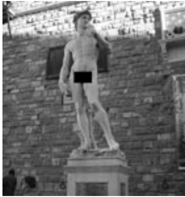
Die Zugspitze is a "G" rated newsletter

The next day we headed to the north part of town where BMW is located. As you travel north, the BMW building comes into view. My wife now has a new perspective of where her car was born, not at Habberstad as she once thought. The BMW Zentrum, containing many cars from BMW past, present, and future, is closed for about two years for expansion. I saw this already in 2001, so I wasn't that upset. There is a temporary museum set up in the Olympic park across the street from BMW. That's where a lot of interesting cars reside. After the BMW museum I wanted to rent a 1 series, and drive an hour and a half on the autobahn to Stuttgart to see some PORSCHE stuff. I got that evil look again from princess. I found a toy store near our hotel. There were five aisles from the floor to the ceiling of die cast model cars. I knew the Germans where passionate about cars, but this was insane. I bought only what