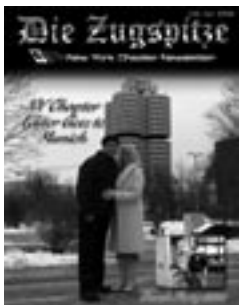
On The Cover Your Chapter Editor and his wife in Olympic Park, Munich.