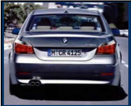
Nice Ass, Huh ?!