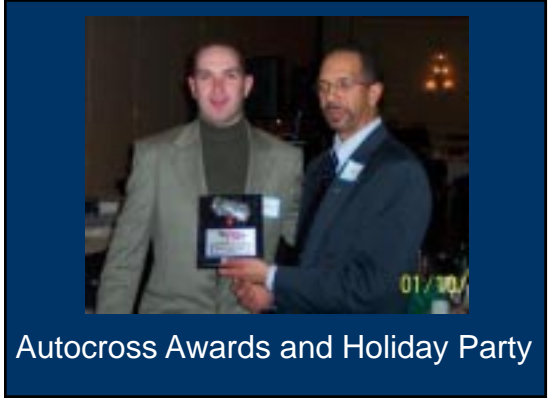
Autocross Awards and Holiday Party