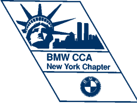
Back on Track

BMW Car Club - New York Chapter www.nybmwcca.org