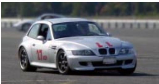
Car of the Month - Who's next?