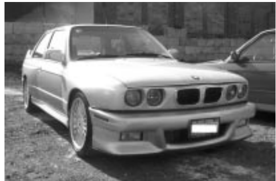
It's ahh.....don't tell me ..wait ! uhhhh !