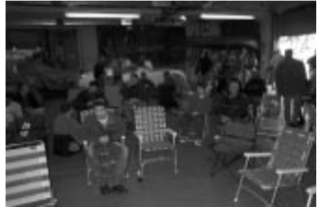
Beach Party Natives !