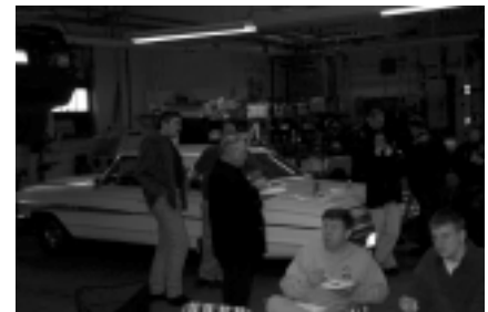
Is that a Ford?