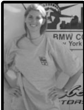
Short Sleeve Tee - $12 Sizes - L-XL-XXL*