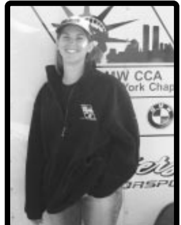
Fleece Jackets - $49 Sizes - S-M-L-XL-