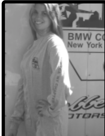
Long Sleeve Tee - $16 Sizes - L-XL-XXL*