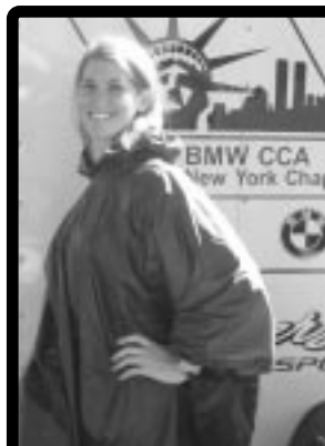
Poncho - $10 One Size Fits All Navy Chapter Logo - Rear