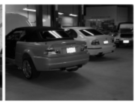
7800 sq. ft. Facility, Engine Rebuilding & Modification, Computerized Alignment