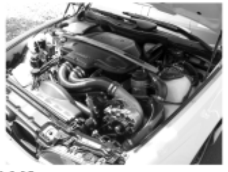
600+ HP Supercharged e39 M5

We carry all Safety & Performance Parts For your car, Call us today!