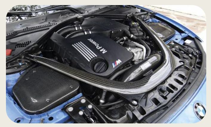
▲ The CSF Intercooler upgrade with the AWE Tuning S-Flo Carbon Fiber intake & AWE Tuning heat exchanger (not shown)

In essence, there's an endless array of things to be done to these, and pretty much any car on the road today. It just so happens that the aftermarket is particularly strong with BMW's ///M cars as the demand for upgrades is huge. We live in a golden age for modifying cars, where parts are easily accessible and the choices so vast. If you've ever considered owning one of the S55-powered M3 or M4 cars I highly recommend them. With just the right upgrades, you too can have a BMW that, when properly equipped, can outrun many of today's exotics and supercars alike for a fraction of the cost.