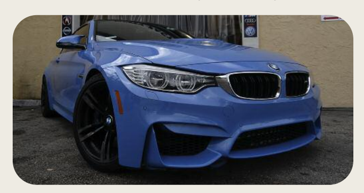
▲ Yaz Marina Blue BMW M4 sitting nicely with H&R hubcentric wheel spacers front and rear