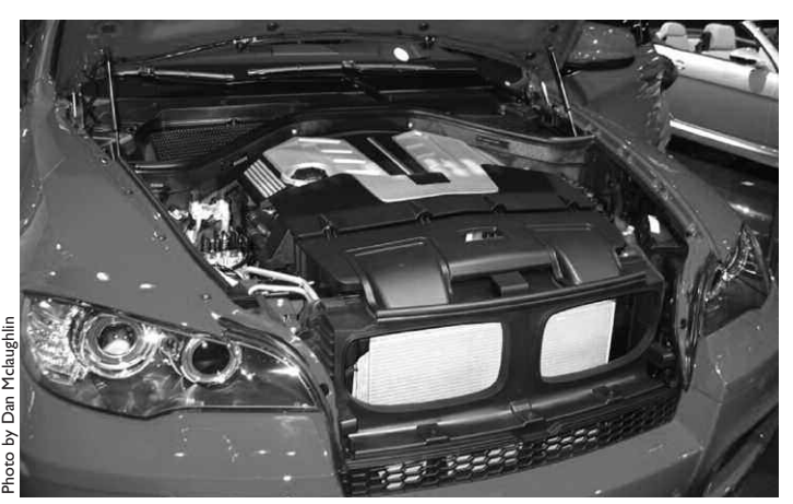
You May Not See It Unless You Remove the Plastic, But The X6 M Has Power!

left in the dark, as the new 2009 Z4 was unveiled at the Geneva Auto Show in March. The Z4 is alive and well and reintroduced as a hardtop convertible. The interior looks quite similar to previous models but the exterior got the make over and looks great. Slightly longer and a pinch wider than its predecessor, the flame surfacing is gone as is its Bangle Butt. The length is added to the trunk area to accommodate the hardtop but this gives it a longer, sleeker look. Engines available are the standard 3.0 liter inline 6 at 258 hp or,