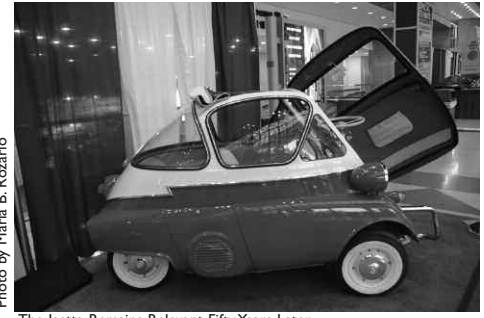
The Isetta Remains Relevant Fifty Years Later.

Finally there was the BMW crossover vehicle, the X6. I've come to reserve my judgment of a