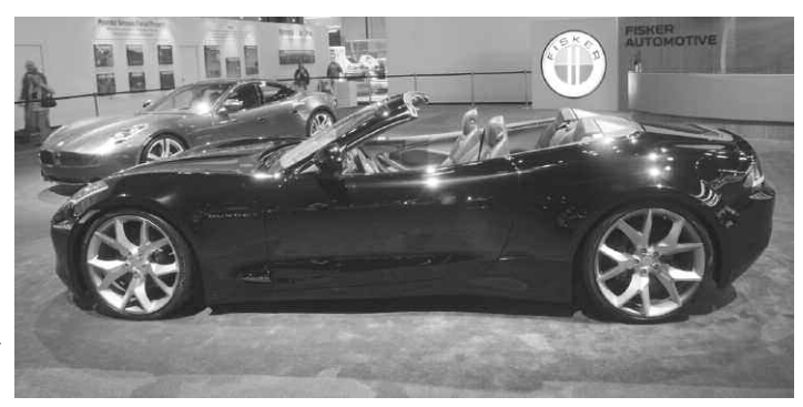
The Beautiful Karma S from Tesla Motors - an electric hybrid available in 2011.

With about 45 minutes left until the general public was to be let in, we were given free reign to explore the rest of the auto show exhibits unencumbered by the crowds. This was the best time to