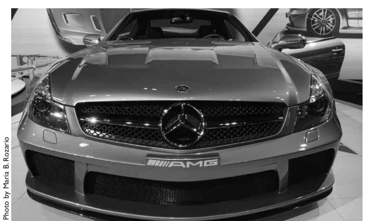
AMG's Latest Offering is Gorgeous from Every Angle

Next up was the Z4. The advertising information for the NY Auto Show actually had listed the Z4 as no more. I guess they were