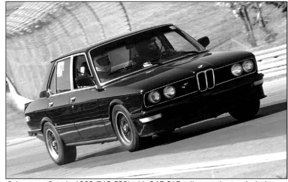
Odometer Gear's 1980 E12 528i with 315,015 miles on the track during the 2008 Oktoberfest in Watkins Glen, NY.

Odometer gears for VDO and MotoMeter repair NEW *** 2002 Odometer Gears are ready