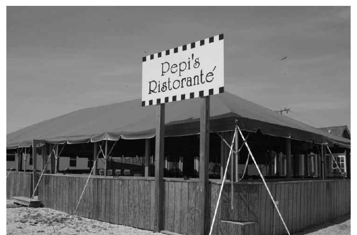
Everyone is Welcome Under The Big Tent

When I received the e-mail, it seemed too good to be true – a restaurant owner who recently purchased a 2006 M3, wanted to host an event – and it's on the North Fork of Long Island where I live!