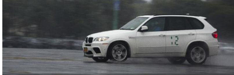
Victor's X5M race car disguised as a truck.