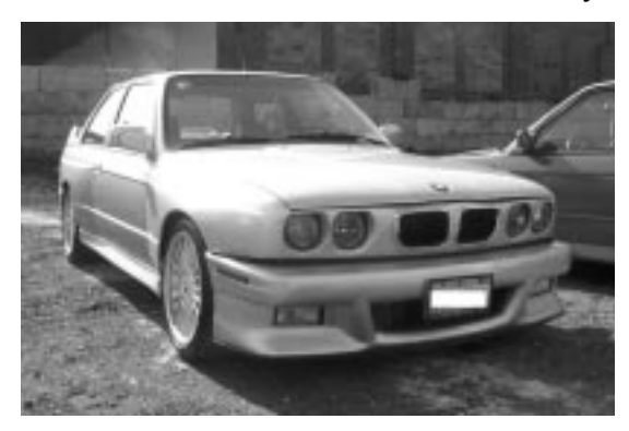
It's ahh.....don't tell me ..wait! uhhhh!