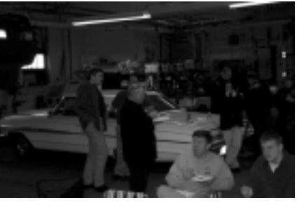
Is that a Ford?