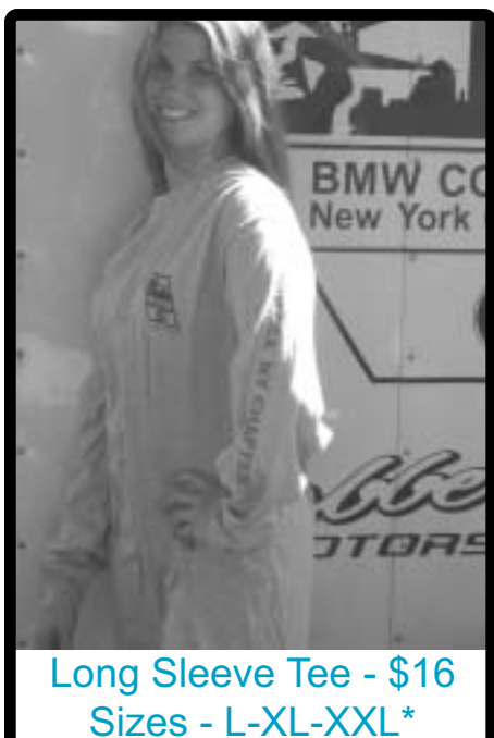
Steel Grey Chapter Logo - Front