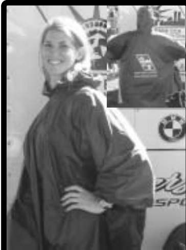
One Size Fits All Any color as long as it is Navy Chapter Logo - Rear