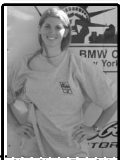
Short Sleeve Tee - $12 Sizes - L-XL-XXL* Steel Grey Chapter Logo - Front