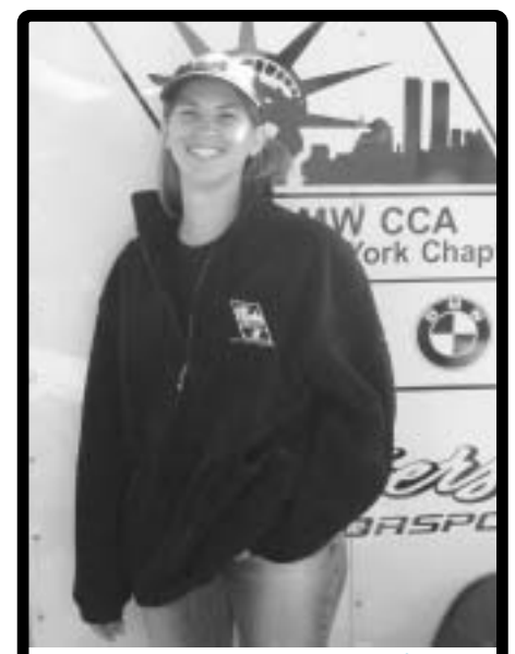
Fleece Jackets - $49 Sizes - S-M-L-XL-XXL<sup>3</sup> Navy•Black•Red•Grey Chapter Logo - Front

Mail To: NY BMW CCA PO Box 607 Westbury, NY 11590 Checks • Money Name: Add $3.50 Paypal Fee Orders Address: Shipping $3.50 City/State/Zip: per item Email: Tel No: Certain Sizes Enter Color/Qty: Poncho Fleece and Colors May Require Short Sleeve Tee_ Long Sleeve Tee Special Ordering Cap____Total $ Titanium Key Ring